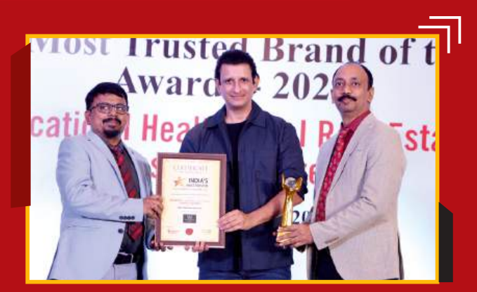
Most Trusted Coaching Institute Award Global Innovative Coaching Award Gorkhpur Ratna Award